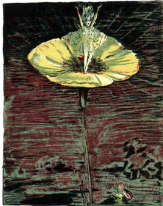
The Fairy Flower

"You were Real to the Boy," the Fairy said, "because he loved you. Now you shall be Real to every one."